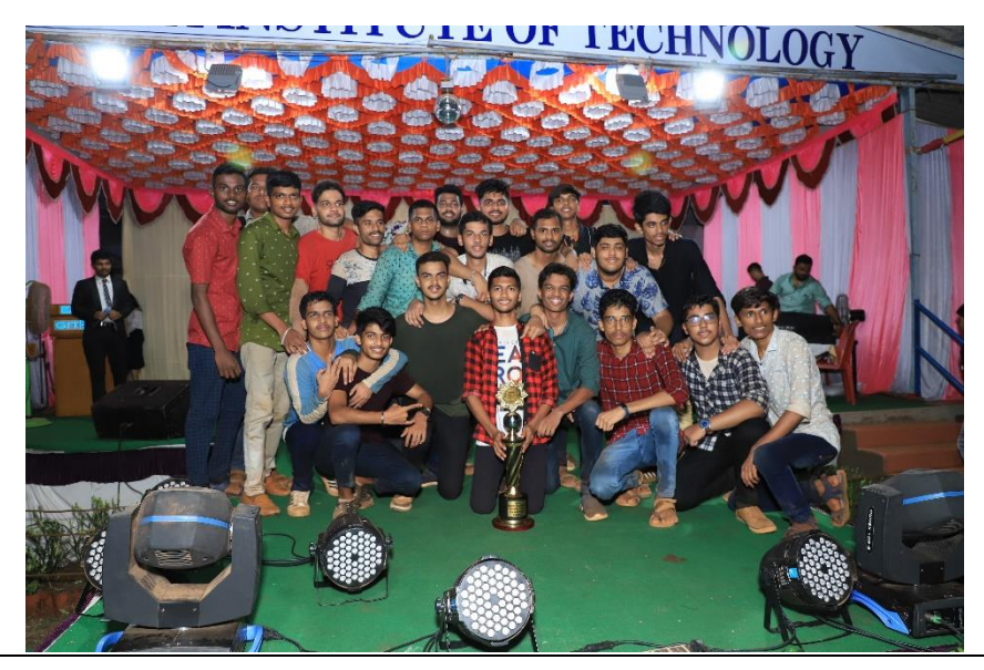
SYNERGY 2022 CHAMPIONSHIP TROPHY WINNER-COMPUTER ENGINEERING DEPARTMENT